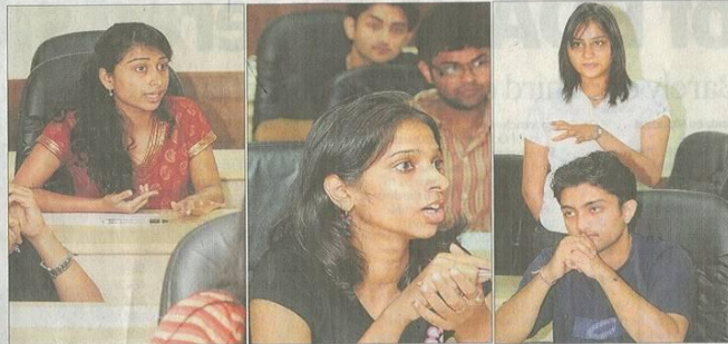
A CLASS ACT Students drive their points home

"Our syllabus and curriculum is constantly revised and made industry-friendly based