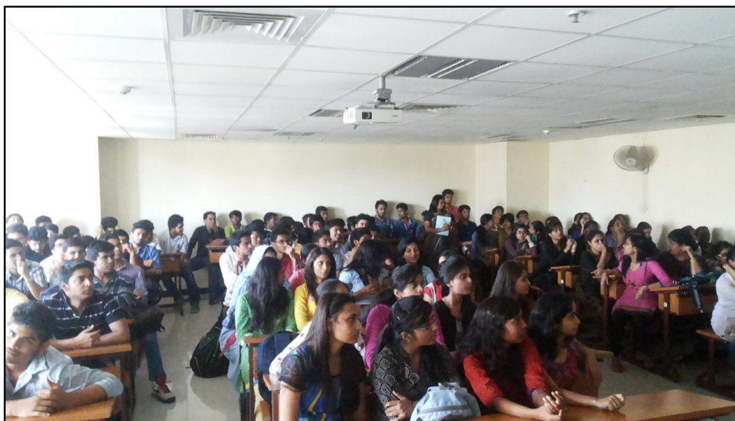
Movie being screened for IV semester students