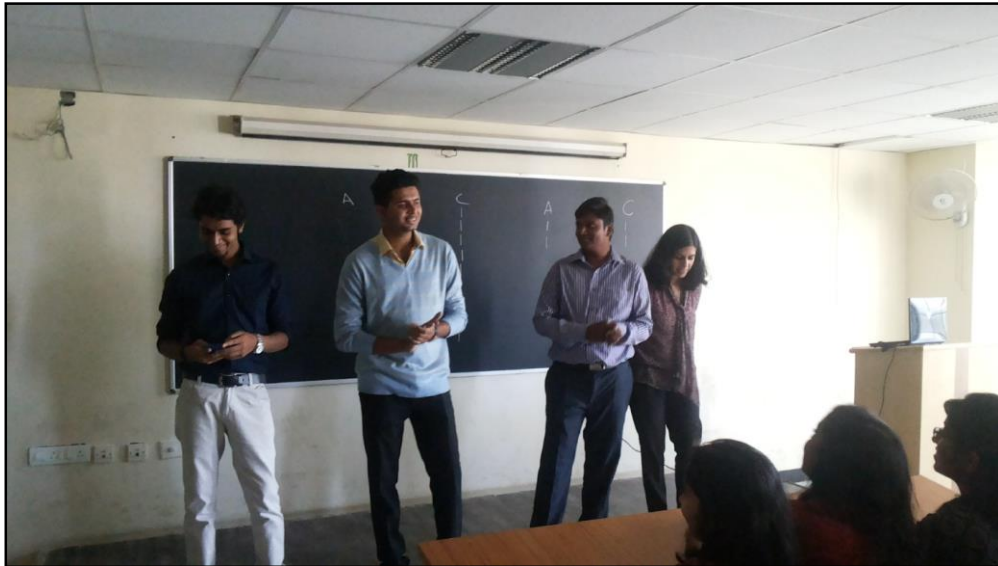
Volunteers of EDUCOMCINE introducing the concept to the audience

The response for the movie was positive and the students were able to relate the movie to their subject and learnt the Entrepreneurship concepts in a better way.