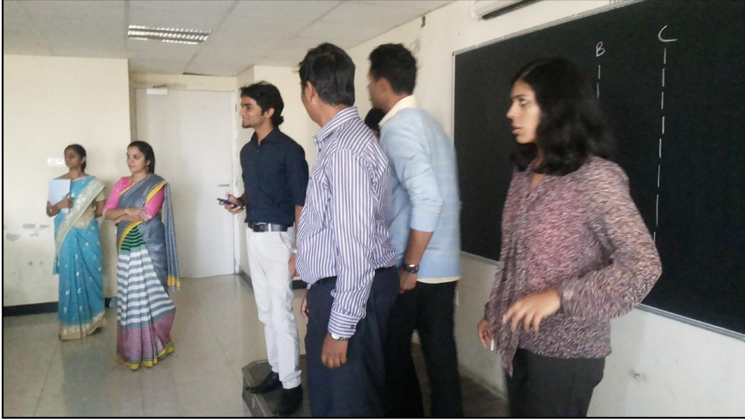
The Question and Answer session being conducted by the team