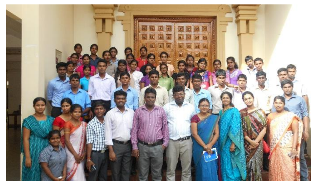
Glimpse of Sessions at Jaffna University